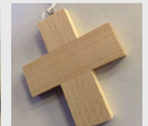
094/L 3"x 3,5"