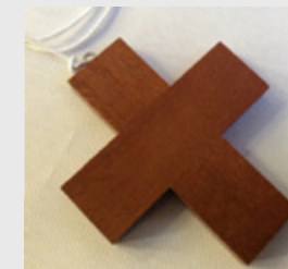
094/D 3"x 3,5"