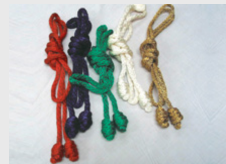
E6 CINCTURES with knot, length 118"